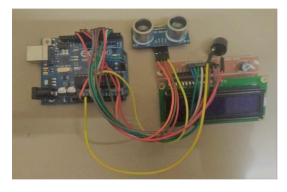
Fig 1(b) Ultrasonic Waist Belt Sensor system

The output is modelled in the belt form, the Arduino Nano microcontroller, ultrasonic sensor, power supply, alarm, Bluetooth, voice module (voice and play back circuit), vibration motor are integrated with the belt. This belt is worn by the user (blind people) in their waist.