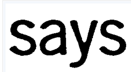
Fig.3. Binary output image

After, getting the min and max value convert Scaling function. The cv ConvertScale has several different purposes and thus has several synonyms. It copies one array to another with optional scaling, which is performed first, and/or optional type conversion, performed and get the binary output.