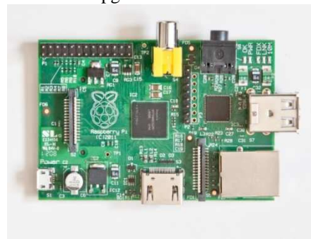
Fig.1. Raspberry pi is the simple hardware system which ensures portability of the assistive reading system

The Raspberry Pi is a credit-card-sized single-board computer developed in the UK by the Raspberry Pi Foundation. It has a Broadcom BCM2835 system on a chip (SoC), which includes an ARM1176JZF-S 700 MHz processor. And primarily uses Linux kernel-based operating systems. Memory (SDRAM) of 256 MB shared with GPU which can be upgraded to 512MB.