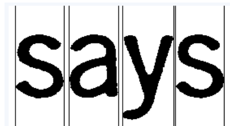
Fig.4. Cutting out the letters

Tesseract is a free optical character recognition engine, originally developed as proprietary software by Hewlett-Packard. We used a very naïve approach to separate individual letters from the words. First we scanned the vertical columns of pixels from left to right and stored the numbers of the columns in which all pixels were white. Next we looked at the vector of column numbers and determined where they are interrupted. These points became the cutting points.