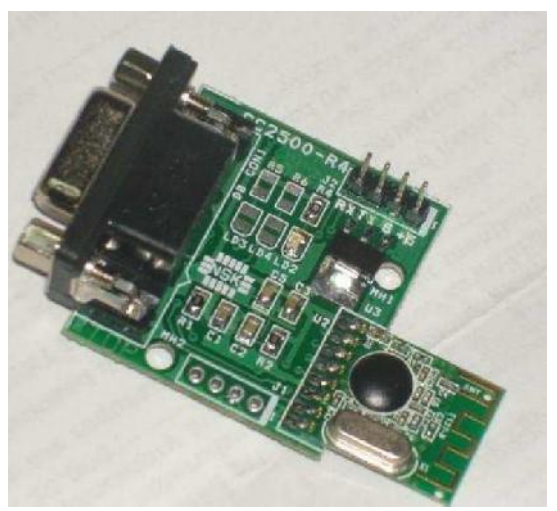
Fig 3. Zigbee Transceiver

control and controlled circuits), or where several circuits must becontrolled by one signal. In our project, at the transmitting side, when the keypad is pressed controller makes the relay ON, signal from the reader is sent to the PC via Zigbee. At receiving side, when the keypad is again pressed, controller makes the relay OFF, signal from PC is sent to Portable unit viasame Zigbee.