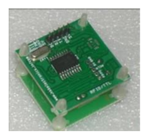
Fig.2 RFID Reader 125 kHz

2)Touch Probe with RFID Reader: Touch Probe is the Plastic case which contains the RFID reader is shown in the Fig 2. This is for easy handling. The touch probe should have proper size so that it can fit onto the knee area of an adult person. This Touch probe will send the RF signal from the reader to the human body and receives the tag data and send to the controller.