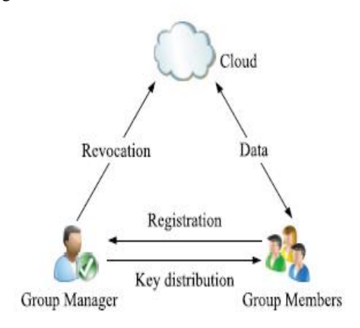
Fig. 1. System model.

We consider a cloud computing architecture by combining with an example that a company uses a cloud to enable its staffs in the same group or department to share files. The system model consists of three different entities: the cloud, a group manager (i.e., the company manager), and a large number of group members (i.e., the staffs) as illustrated in Fig. 1.